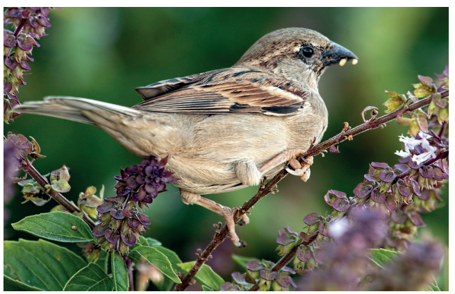
A sparrow finds the seeds of this wildflower hard to resist, though but for the humble bee, the wildflower wouldn't be there...!

activity, they play a major role in the production of the food we eat. As pollinators of commercial crops such as tomatoes, peas, strawberries and apples, bees are estimated to contribute over £400million to the U.K. economy every year!