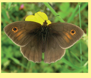
Meadow Brown (Maniola Jurtina)

The Meadow Brown is the most abundant butterfly species in many habitats. Hundreds may be seen together at some sites. These butterflies even fly in dull weather where most other butterflies are inactive.