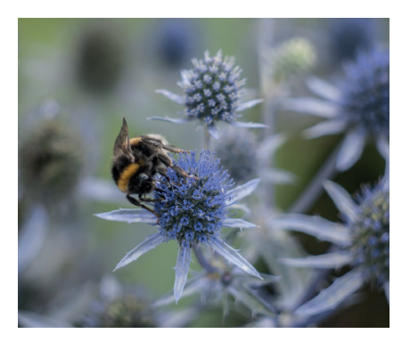
Provide plants for bees in winter months as well as during the summer.

It is important to support bees throughout the seasons of the year - overwintering queens and workers will still be seeking food on warm winter days! In Spring offer bluebells, crab apple, daffodils and forget-menots, in Summer try comfrey, delphiniums, sweet peas and borage, in Autumn provide fuschia, dahlias, thistles and verbena and in Winter spoil your bees with wall flowers, heather, ivy and daphne!