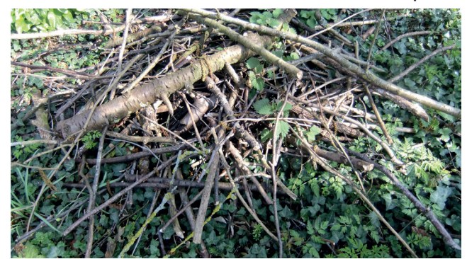
In a world of tidy gardens, spare a thought for the bugs - rather than burn fallen branches, leave a small pile where they can shelter...

Dead wood is becoming an increasingly rare habitat, due to modern well kept gardens, parks and hedgerows. It is essential for supporting centipedes, woodlice and many wood boring beetles, as well as a wide range of fungi. So, don't burn fallen branches on the bonfire - stack wood in piles in sheltered corners