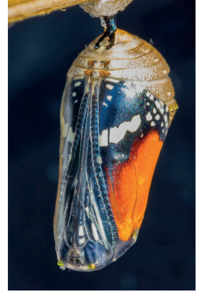
A colourful butterfly emerges from its chrysalis

All these factors spell disaster for our butterflies and moths!