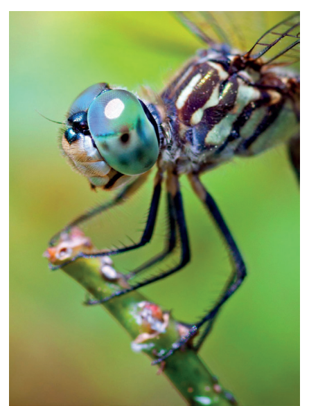
Dragonflies and other insects enjoy ponds or marshy habitat.

If you are short of space in the garden, you can create temporary insect accommodation by filling tubes of chicken wire with leaves and tucking at the back of flower borders. Empty them after the leaves have rotted down in the Spring.