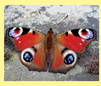
Peacock (Aglais io)

As its English name suggests, the Gatekeeper butterfly is often found where clumbs of flowers grow, in gateways and along hedgerows. It is often seen together with the Meadow Brown Butterfly.