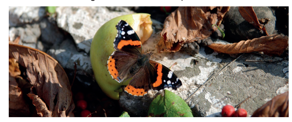
Butterflies enjoy windfall fruit left in the garden.

Butterflies will visit gardens of any size or shape if they can feed from suitable nectar-rich plants. Nectar provides nutrients for healthy growth and energy for flight and egg laying. It is particularly important in Spring when migratory butterflies need to "refuel" after arriving in Britain from Europe or Africa.