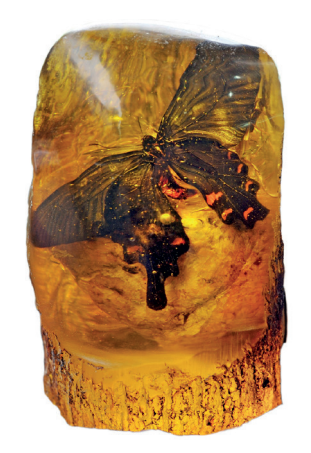
Butterflies have been found fossilised in amber