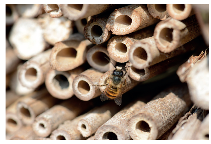
Bees like to lay their eggs in hollow garden canes.

In gardens, female bees seek dark cosy holes in the ground, under sheds or within shady piles of leaves - spots which are not exposed to direct sunlight for too long, as this can overheat the