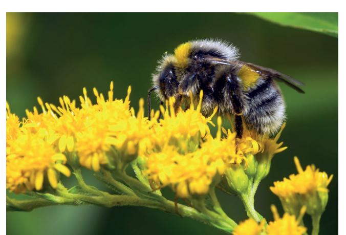
The Great Yellow Bumblebee is facing extinction in the U.K.

Since the start of the 20th. century, the Cullem's Bumblebee and the Short-haired Bumblebee have become extinct in the U.K. If habitat and food sources are not increased and protected,