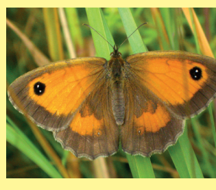
Gatekeeper (Pyronia Tithonus)

The Meadow Brown is the most abundant butterfly species in many habitats. Hundreds may be seen together at some sites. These butterflies even fly in dull weather where most other butterflies are inactive.