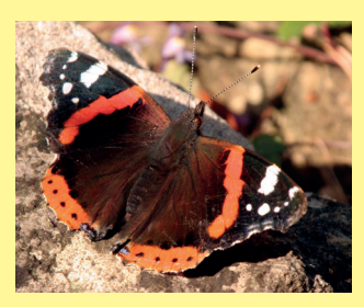
Red Admiral (Vanessa Atalanta)

This is one of our rarest and currently restricted to the Norfolk flying over open fen vegetation Thistles or Ragged Robin.