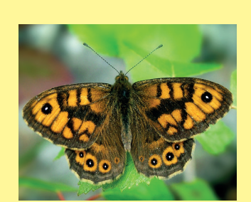
Wall Brown (Asiommata Megera)

This butterfly flies high in the tree tops of well wooded areas in central southern England. It feeds on aphid honeydew and sap.