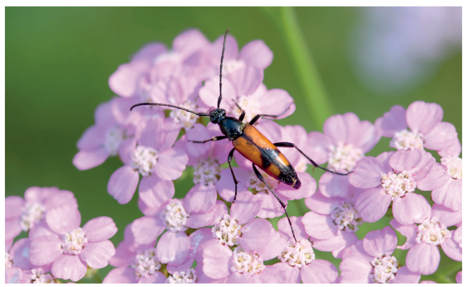
Bugs are essential for plant pollination and pest control.

Insects are vitally important to a healthy planet. Humans and other life forms could not survive without them and once lost, they cannot be replaced. The food we eat, the fish we catch, the birds we hear and the flowers we smell, simply would not exist without bugs - without them the world's eco systems would collapse.