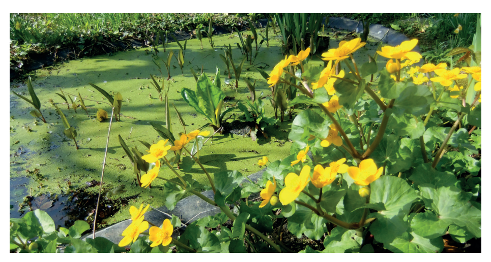
A pond encourages both bugs and amphibians alike!

If you do not have space for a pond, a densely planted marshy area will provide the cool shade loved by many bugs and amphibians.